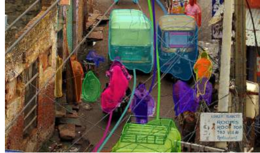
Fig. 1: We highlight the performance of our tracking algorithm, RoadTrack, in this urban video. This frame consists of 27 road-agents, including pedestrians, two-wheel scooters, three-wheel rickshaws, cars, and bicycles. RoadTrack can track agents with 75.8% accuracy at approximately 30 fps on an TitanXp GPU. We observe average improvement of at least 5.2% in MOTA accuracy and 4× in fps over prior methods.

Recently, techniques based on deep learning are widely used for object detection and tracking. In order to solve