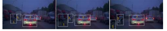
Fig. 3: Qualitative analysis of RoadTrack on the TRAF dataset at night time consisting of cars, 2-wheelers, 3-wheelers, and trucks. Frames are chosen with a gap of 2 seconds ( \sim 60 frames). For visual clarity, each road-agent is associated with a unique ID number. The ID is displayed in orange. Note the consistencies in the ID, for example, the 3-wheeler (1), car (2), and 2-wheeler (3).

We denote the multiple object tracking accuracy, MOTA of a system using a particular motion model as MOTA^{\text{model}} and define it as MOTA^{\text{model}} = \sum_c MOTA_c + \sum_i MOTA_i where c and i denote an agent whose motion is being modeled using collision avoidance and interaction, and MOTA_c and MOTA_i denote their individual accuracies, respectively.